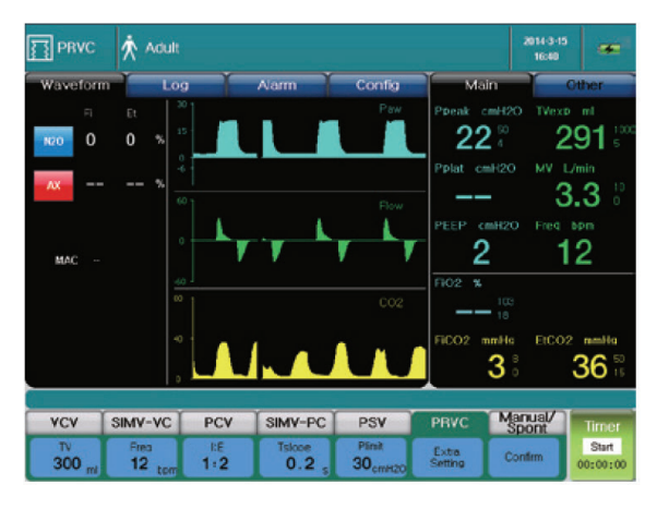
Advanced ventilation mode