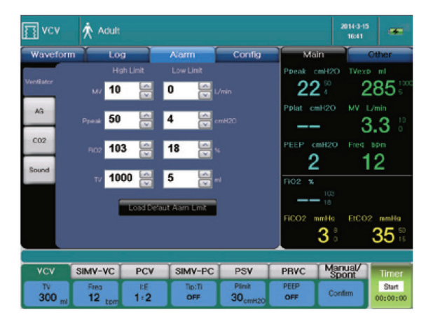
Alarm setting interface