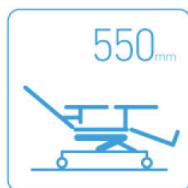
The lowest height is 550mm. easy to sit