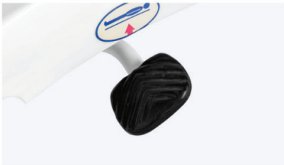
Hydraulic treadle for rise